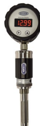
AcuDew shown with AcuLoop plug in display. AcuLoop sold separately.

The Model Acudew is supplied ready to use, with a Certificate of Calibration traceable to National and International Humidity Standards, instruction manual and two metres of cable.