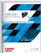
LANCOM 4 PORTABLE FLUE GAS MONITORING

DISCOVER HOW OUR BROAD RANGE OF NON-CONTACT TEMPERATURE MEASUREMENT AND COMBUSTION & EMISSIONS PRODUCTS OFFER A SOLUTION FOR YOUR PROCESS