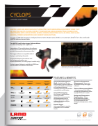
CYCLOPS LOGGER SOFTWARE

SEE OUR OTHER RELATED LITERATURE FOR THE CYCLOPS L: