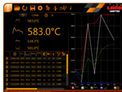
The Table View showing Instantaneous, Valley, Average and Peak, plus the unique Meltmaster temperature (on the 055 L model) readings.

The Trend View displays Peak, Instantaneous, Average and Valley temperatures, Logger settings, Route Manager, Background Correction plus Timed Logging (taking measurements at pre-defined intervals between 1 and 60 secs).