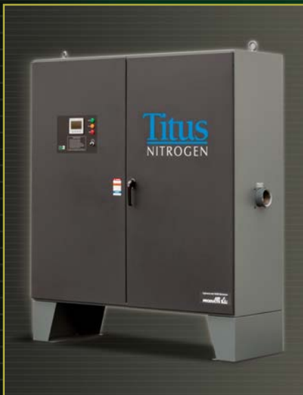
TN2 Series Nitrogen Generators