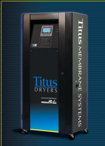
TDD & TDX Series Compressed Air Dryers

Ask Us About These Other Great Products from Titus: