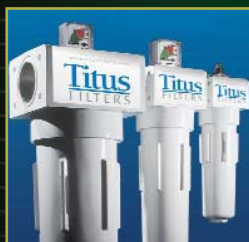
THF Series Compressed Air Filters