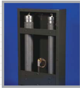
TNX Expansion Kit

Expand your capacity as needed (up to a factor of 4 from base models). Capacities range from 110 to 2800 SCFH with purities ranging from 95 to 99.9%.