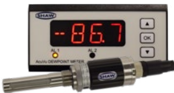
* AcuDew Dewpoint Transmitter sold separately

Various dewpoint ranges are available covering an overall range from -120 °C to +20 °C dewpoint (-184 °F to +68 °F). The 4-digit, 14 segment LED display can be factory configured to display in °C dewpoint, °F dewpoint, ppm(v), ppb(v), g/m 3 and lb/MMSCF.