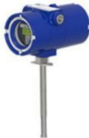
Single Point Insertion Meters