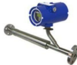
In-Line Flow Meters