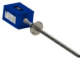
Multipoint Insertion Meters