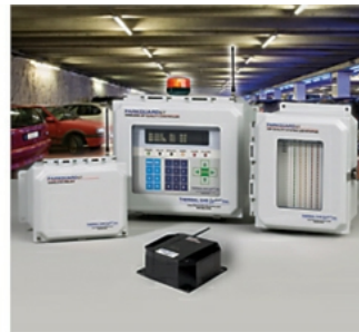
Haloguard II IR

Combines the HALOGUARD Microprocessor based controller and a highly selective and sensitive remote infrared module to provide the most advanced system for detecting the presence of halocarbons.