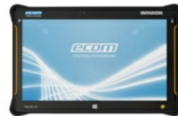
Explosion-Proof Tablet Computer

Efficient solution for challenging scan operations in explosion-hazardous areas