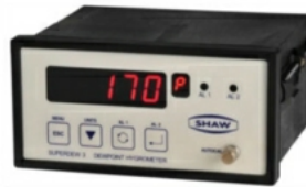
Inline Moisture Analyzers

All Moisture Meters portable dewpoint meters and hygrometers are fully self-contained and combine robust construction advanced electronics