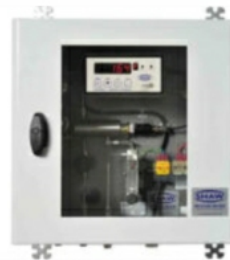
Sample Systems for Process Air or Gas Analysis

Designed with the operator in mind, for reliable and accurate measurements, the SHAW Model SDT and SDT-Ex are extremely easy to install and operate, requiring little or no maintenance