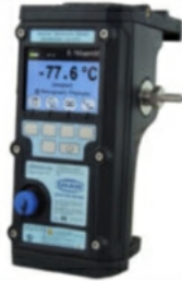
Portable Dewpoint Meters & Hygrometers

Portable dewpoint meters, hygrometers and moisture analyzers