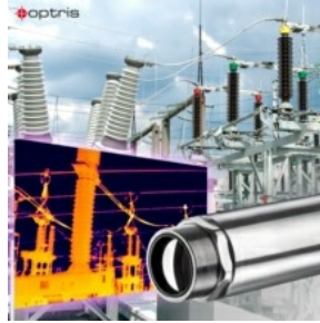
Xi 410: Compact Industrial Imager

The thermal imager Optris PI 640i is the smallest measuring VGA infrared camera worldwide .