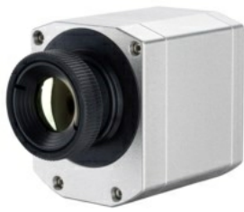
Infrared Camera PI 640i

The thermal imager Optris PI 640i is the smallest measuring VGA infrared camera worldwide .