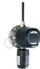
Wireless Gas Detection