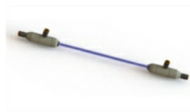
MRD Series Gas Dryers