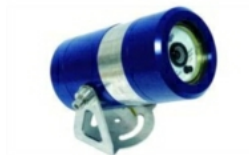
Draeger Flame Detection