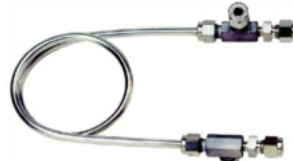
MD Series Gas Dryers