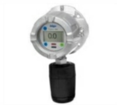
Carbon Dioxide, Hydrocarbons and Combustible Gas Detection