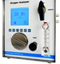
Industrial Oxygen Analyzers