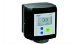
Oxygen and Toxic Gas Detection