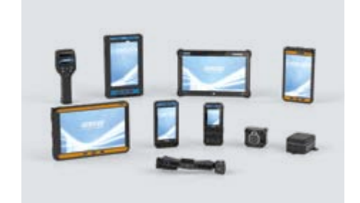
Tablets Smartphones Peripherals