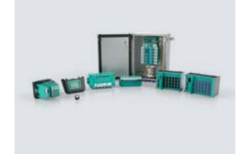
Ethernet APL Advanced Diagnostics FOUNDATION Fieldbus H1 PROFIBUS PA Ethernet