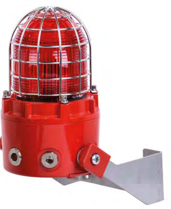
D1xB2 beacons - bracket mounting allows beacon to be rotated in any orientation

The globally approved D1xB2 family from E2S offer the most comprehensive range of solutions for UL1638 signaling in Class I/II Div 1 or Zone 1/20 explosion proof applications..