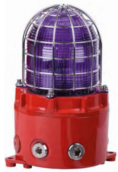
D1xB2 beacons- surface mounting