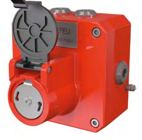
GNExCP7-PT / GNExCP7-PM